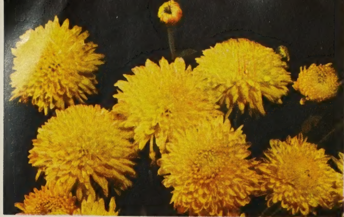
DELIGHT. 60c each; 3 for $1.50